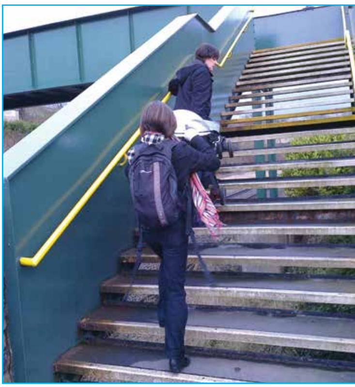
CHINLEY: Struggling with a baby buggy over the station bridge

Government-contracted franchises should not be able to ignore the needs of significant sections of society in this way, especially when the Passenger Assist option offered to wheelchair users is