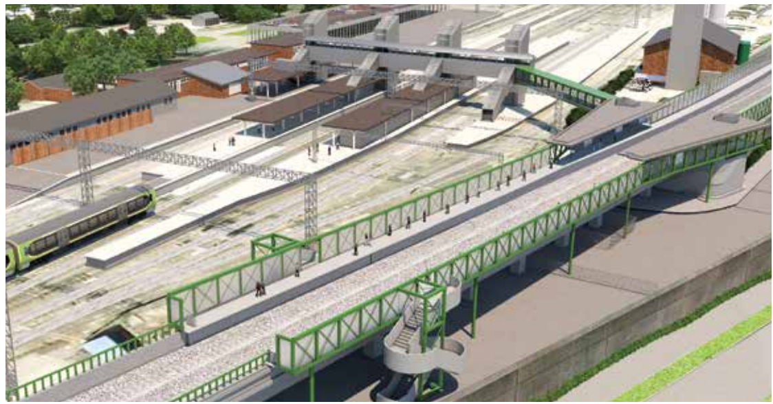
BLETCHLEY: This is an artist's impression of what Bletchley station might look like if the East West Rail route is built. The EWR station would be built on the 1960s concrete flyover with a footbridge connection to the existing station on the West Coast main line. According to a report in New Civil Engineer, the cost of the East West Rail project has been cut by a third and construction work should start next year

Railfuture has been the campaigning name of the Railway Development Society since 2001. But from 1 January 2018, Railfuture will be the official name too. The change of name was approved by the annual general meeting in May. The name of our