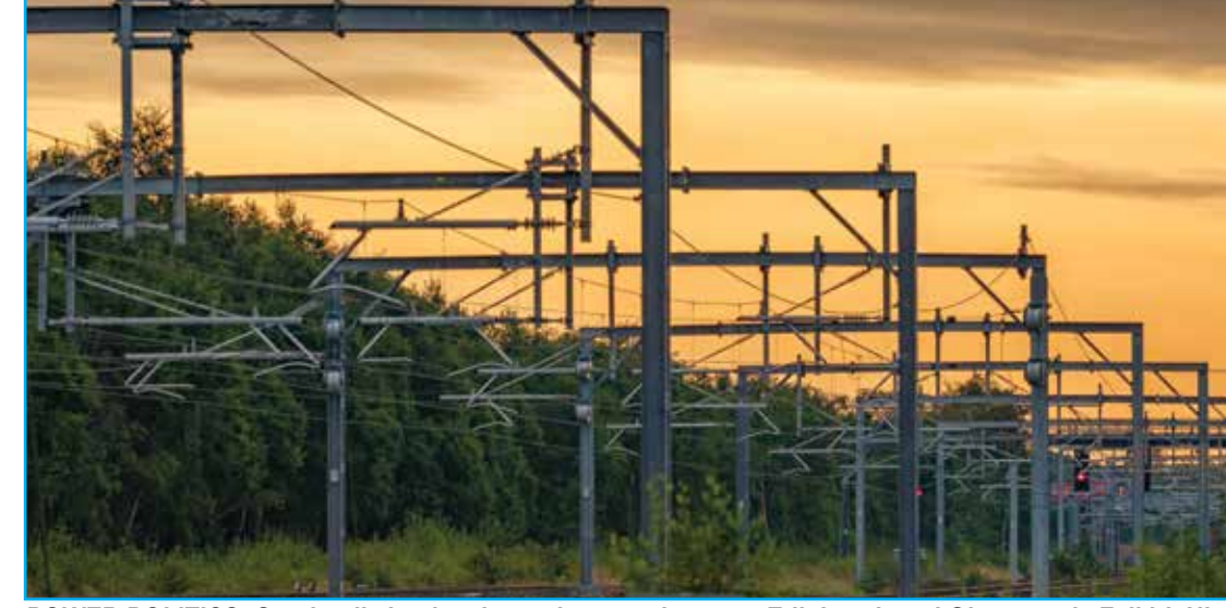
POWER POLITICS: Scotland's busiest inter-city route between Edinburgh and Glasgow via Falkirk High is being electrified as part of EGIP (the Edinburgh to Glasgow Improvement Programme)

The case for further electrification remains strong as one element of route modernisation to improve the capacity, quality and resilience of the railway for passengers and freight customers, but it may not be the first priority. Our job is to articulate that case clearly and move opinion formers to the position where it is no longer a threat, but part of a structured solution to delivering the bigger and better railway we all want to see. Then it becomes