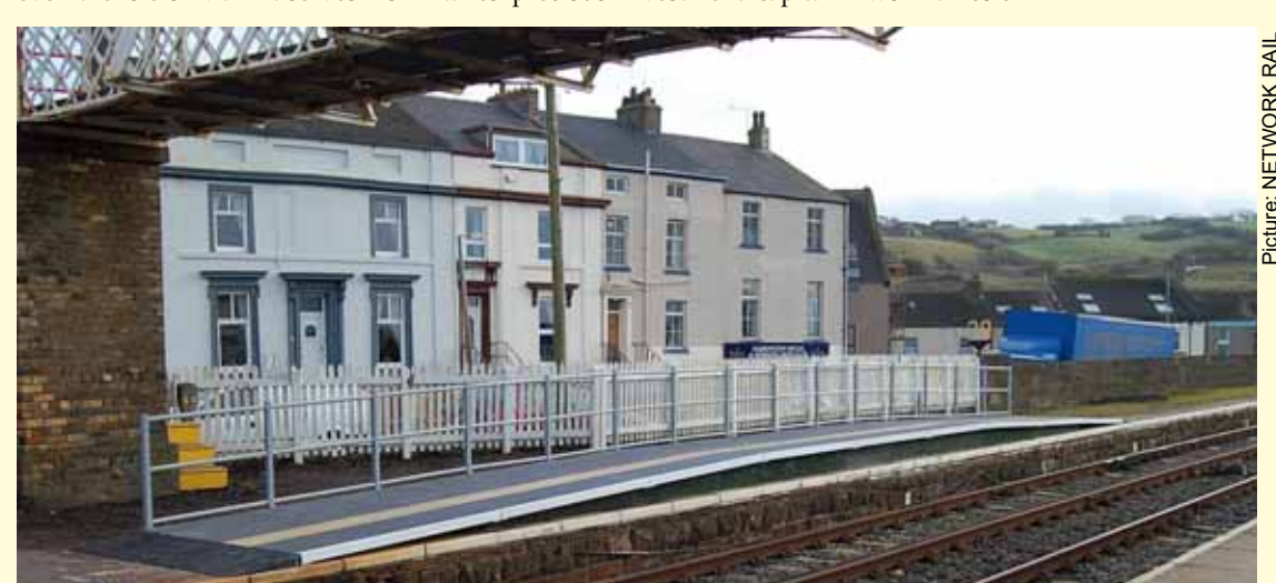
CLOSING THE GAP: The Harrington hump improved access and saved more than £200,000

See www.acorp.com for further details and links to each partnership and other useful information at www.dft.gov.uk and www.networkrail.co.uk