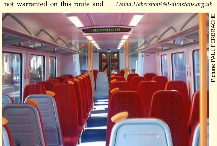
CRAMPED: Two by three seating in the class 450s