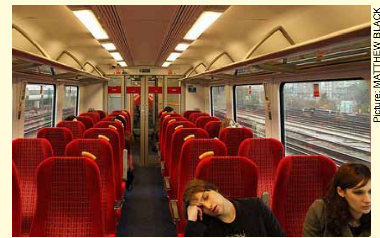
ROOMY: Two by two seating in the class 440s

David Habershon, Horndean Road, Emsworth PO10 7PT