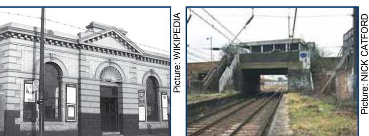
Lea Bridge station in the 1940s, left, and in 2008, right

The Chingford to Stratford rail service would also have the