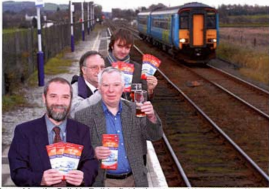
Launching the Rail Ale Trail leaflet in the appropriate manner at Hoscar station - and at the Railway Tavern next to the station