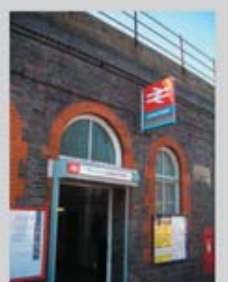
Entrances - Mentmore Terrace

The station is also only five minutes away from Hackney Town Hall and the shops of the town centre. Already many people visiting the town hall and nearby Hackney Empire theatre use the station. London Fields could become the new green gateway to Hackney.