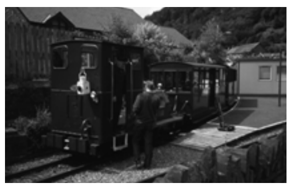
CORRIS STATION: Does it have more potential?