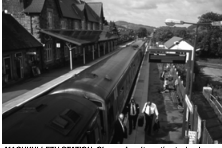
MACHYNLLETH STATION: Change for alternative technology

world of sustainable energy and an achievable, re-thought travel life style.