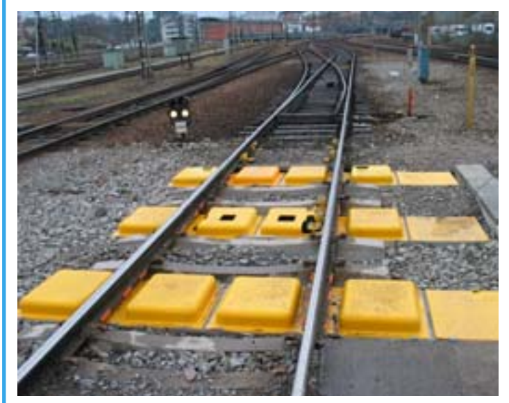
TRACK WATCH: The VIEW TM Technology checks for worn components on trains

Readers of this column are probably getting bored with items on this topic, but the franchise consultation has given an opportunity for a major push to make the fourth busiest