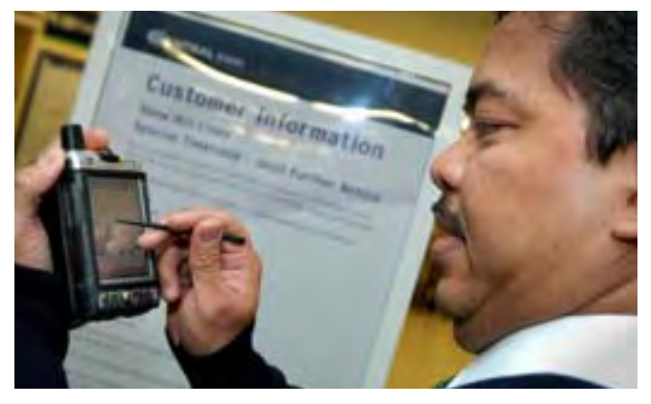
Pocket size computers, equipped with wireless internet technology, are being issued to Central Trains station staff to ensure that passengers obtain up-to-the-minute train running information. On GNER it is now possible for passengers to connect to the world wide web via a wireless connection on the train. Train operator Southern is also introducing a similar service on its trains

Although the site was found to be adequate, concern has been raised over the suggestion made in the report that it was particularly suitable because workers in Corby would accept lower wages.