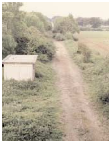
How safe? This is the trackbed of the former Dereham to Fakenham line soon after the track was lifted. Can the Regulator's rules save it for the future?

The Regulator is also exempting 12 schemes which are are on their way through, so it is