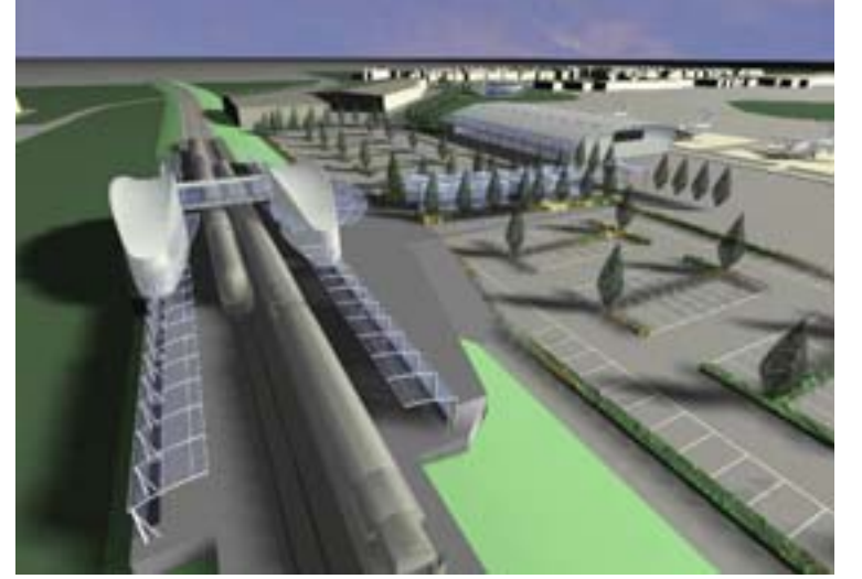
Multi-million pound plans for a new terminal and rail station at Southend airport are aimed at allowing the airport to handle 300,000 passengers a year and for bigger jets to fly in.

The situation at Shotton station is a disgrace, both in terms of the train services provided and the facilities. It serves a bigger population than many other stations in North Wales but has only an hourly service on both the main line and the Wrexham-Bidston line. The smaller town of Flint has recently gained some Virgin Trains services to London, but Shotton has not. Enormous traffic jams regularly plague the area but there is no attempt to