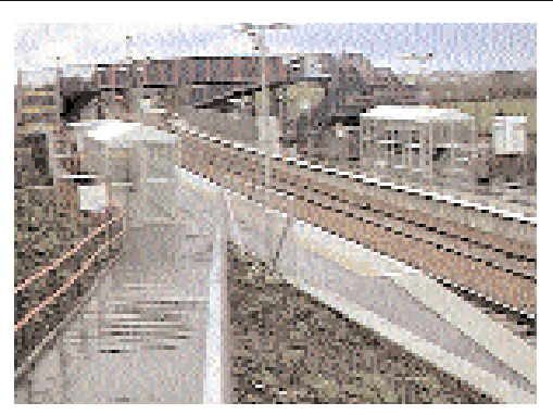
The first station to open in the 21st century: Dunfermline Queen Margaret station began operation in January and is well situated for the hospital, which has parking problems like many other hospitals. The next station to open in Fife should be in east Kirkcaldy. This will complete the long gestation of stations in south Fife that started with Thornton. Congratulations to Fife Council for progressing these despite endless problems.